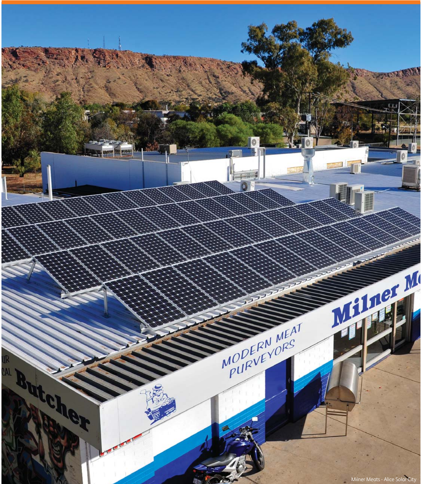
Milner Meats - Alice Solar City