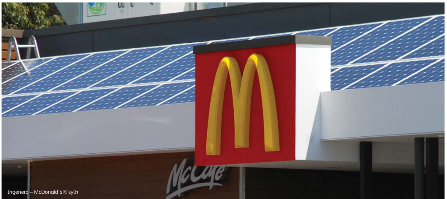
Ingenero – McDonald's Kilsyth

If you are unable to install solar PV panels on your building but wish to source part of your business's electricity from renewable sources, then you should explore GreenPower options greenpower.gov.au